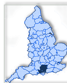
Hampshire County Council South-East Government Region

Hampshire County Council is a large local authority with over 500 schools and about 17,000 children potentially eligible for free school meals. SDA provide cloud-based services for local authorities and central government departments, including the Department for Education (DfE).